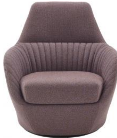
SWIVELLING ARMCHAIR COMPLETE ITEM